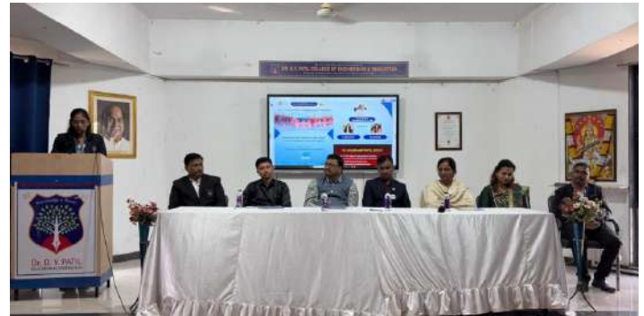
Chief Guest on the Dias on 4 th November 2025.

Poster Presentation on 4 th November 2025.