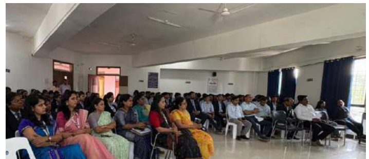
Poster Presentation on 4 th November 2025.