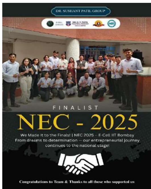
DYPCOEI E-CELL Team finalist for NEC-2025.